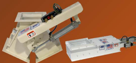
Gates and Valves