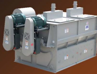
Twin Shaft Mixers